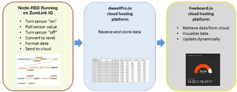
Figure 2: Process flow via Node-RED running on ZumLink IQ

The ZumLink IQ radio runs a Node-RED App that turns the sensor on at discrete time intervals, takes a hydrostatic pressure reading, turns the sensor off, and converts the pressure data to a tank level measurement. It then publishes this data to the dweetPro.io cloud-based IoT hosting service. A dashboard created on the freeboard.io service accesses the stored data and presents the live tank reading.