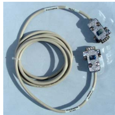
ECD2409NM NULL MODEM Cable, DB9 to DB9, male to male, 6 ft length - For use between Plus radio to enclosed serial radio