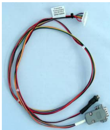
ASC3610CP NULL MODEM Cable, 10 pin board level connector plus a power jack to DB9, 36" length