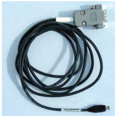
ASC0409NM NULL MODEM Cable, Diagnostics & Programming, 3 pin enclosed radio connector to DB9 - For use between Plus radio to enclosed serial radio