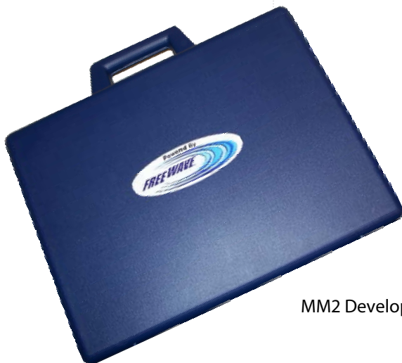
MM2 Developers Kit Case